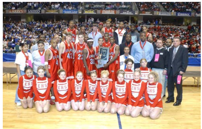
2002-03 IHSAA Class 4A Boys Basketball State Runner-Up Fort Wayne Elmhurst HS