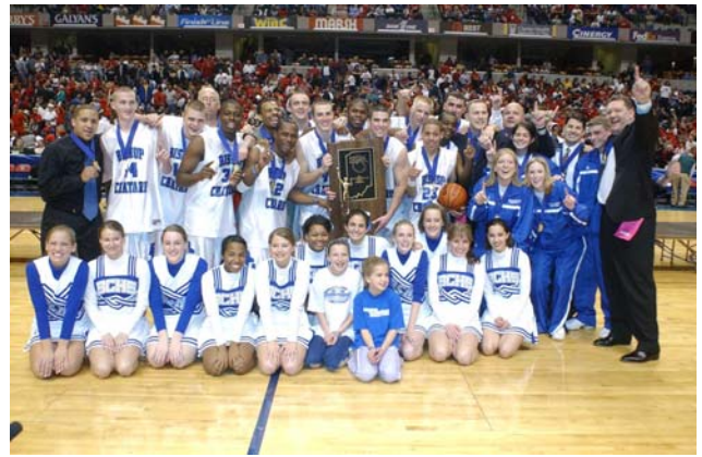
2002-03 IHSAA Class 3A Boys Basketball State Champion Indianapolis Bishop Chatard HS