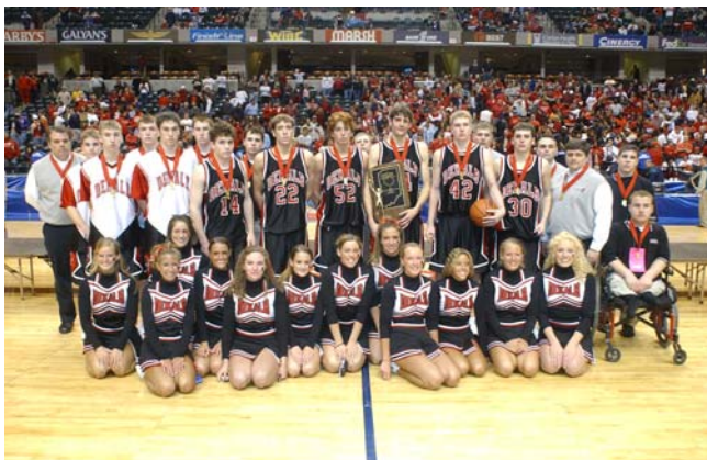
2002-03 IHSAA Class 4A Boys Basketball State Runner-Up DeKalb HS