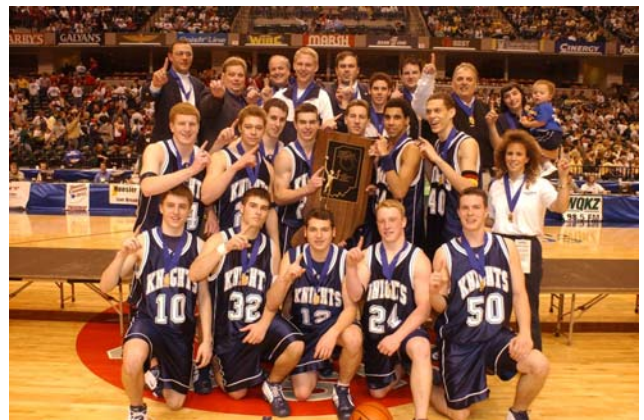
2002-03 IHSAA Class A Boys Basketball State Champion Lafayette Central Catholic HS