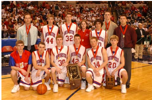
2002-03 IHSAA Class A Boys Basketball State Runner-Up Southwestern (Shelbyville) HS