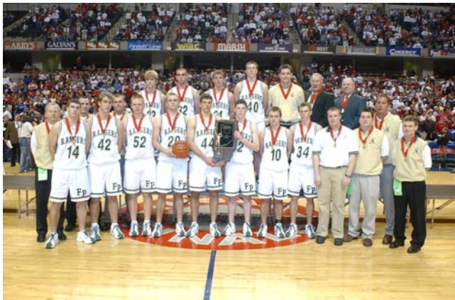
2002-03 IHSAA Class 2A Boys Basketball State Runner-Up Forest Park HS