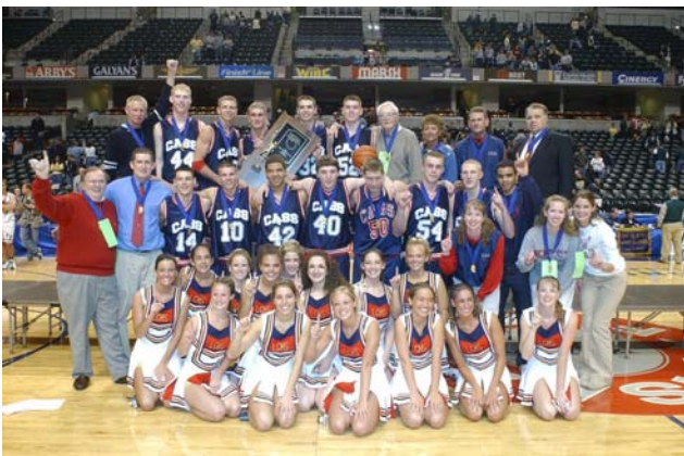
2002-03 IHSAA Class 2A Boys Basketball State Champion Cass HS