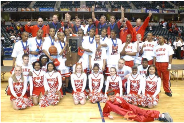
2002-03 IHSAA Class 4A Boys Basketball State Champion Pike HS